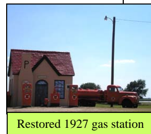
Restored 1927 gas station

Originally, Route 66 stretched 2,450 miles from Chicago, Illinois to Los Angeles, California, along the way passing through Missouri, Kansas, Oklahoma, Texas, New Mexico, and Arizona. In its day, Route 66 allowed the freedom to travel across the American West. During the 1930's, many people from the mid-west migrated to California, and Route 66 helped them to get there. These migrants saw the "Mother Road" as the "road to opportunity." During World War II, Route 66 was highly used to transport troops, equipment, and products across the country to California, where armed force bases had been established. When the war was over, Route 66 brought the troops back home. During its peak, Route 66 was a huge part of the tourist industry, as many motels, service stations, and diners opened along its path.