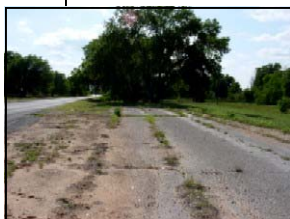
A piece of Route 66 Today

Though Route 66 served a great purpose years ago and is iconic today, it was not destined to last. By the 1970's, major four-lane highways had bypassed Route 66 and in 1984, one final section in Arizona was taken out of commission. In 1985, poor Route 66 was finally taken off maps and its signs removed.