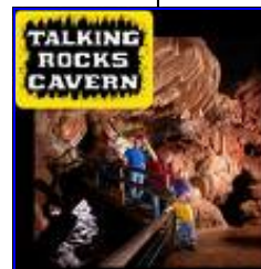
TALKING ROCKS CAVERN

www.talkingrockscavern.com for more information.