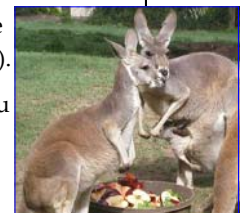
Dickerson Park Zoo

Finally, if you are an animal lover, the Dickerson Park Zoo will be your place to visit. There you can see a wide variety of animals from all over the world. It costs $6.00 for adults and $4.00 for children. You should definitely take ride on the train while you are there. It's only $2.00 extra, and very relaxing. Plus, there are certain animals you can only see by riding the train.