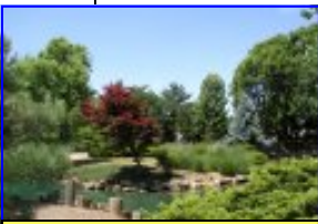
Japanese Stroll Garden

Springfield also has some great parks to enjoy. A great one to visit is Close Park. There you can enjoy a nice, paved trail that surrounds a beautiful lake, as well as many gorgeous flower gardens. They have picnic tables too, in case you want to have a romantic picnic :) It's a very calm place where you can relax. There usually aren't very many people there at one time, so that's a definite bonus. Close Park is part of a big complex of parks located inside Nathanael Greene Park. This is where you will also find the Mizumoto Japanese Stroll Garden, which is a tranquil place of beauty. As you stroll the paths of the garden, you will see lovely plants, open green spaces, many different rocks, sculptures, a bridge, small ponds with ducks, fish, and turtles, and a tea house. This park is open from April 1-Oct. 31 and costs $3.00 to enter. (Other parks in Nathanael Greene are free.) Nathanael Greene Park is located at 2400 S. Scenic Rd. (between Sunshine and Battlefield).