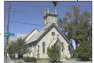
Oldest church in Springfield

The oldest church in town, the Christ Episcopal Church, is right next to downtown, at the corner of Walnut and Kimbrough. You have probably seen it. The first service was held in the building that still stands in 1870. Additions have been made to the church over the years (including very recently), but parts of the sanctuary and the stained glass remain virtually as they were originally.