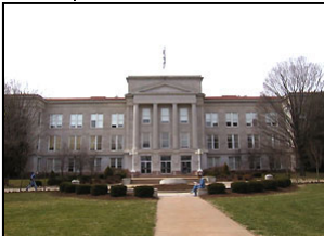
Good old Carrington Hall