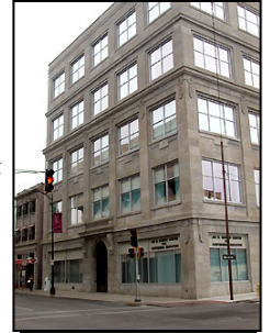
Have you seen this building?

Springfield is a town with many historic buildings and houses. You have probably seen some of them and never knew that they have been around for so long. You attend classes here in the Morris Center, but it hasn't always belonged to Missouri State. Did you know that it used to be the Bell Telephone Building? It was built in 1912 and the Bell Telephone Company was the only occupant for many years. Originally, it only had 3 floors. The 4th and 5th weren't added until 1948. At one point, part of the first floor was rented to the Southwest Missouri Trust Company and later to the Ross Pharmacy. It's hard to believe a pharmacy used to be in this building!