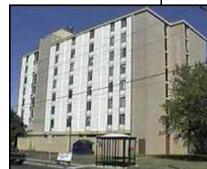
Site of old Kickapoo Indian village

Last week you read about some historic buildings in Springfield. Those were just a very few of the places that have been around since the early years of Springfield. You may have heard of Kickapoo High School or Kickapoo Street, but did you know the Kickapoo were a tribe of Indians? There is a building at the corner of South Avenue and Madison Street where a Kickapoo Indian Village stood from about 1812-1832. In the area was a spring surrounded by 100 wigwams.