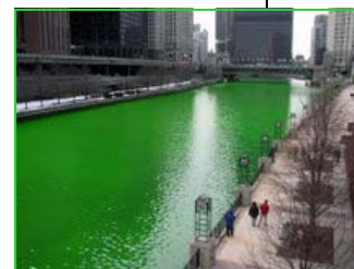
The Chicago River, dyed green