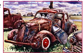
"Red Wheel" by Henk Pander