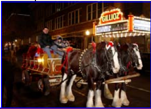
Horse Drawn Carriage Rides

This Saturday, Nov. 17, will be the first day of the festival. From 4:00-5:00pm, you can ice skate for free at Jordan Valley Ice Park (skate rental $2.50). Then, at 5:00p.m., the City of Springfield will host a tree lighting celebration at Jordan Valley Park with the Mayor. At 6:45pm, Hammon’s Field and the Springfield Cardinals will hold a fireworks show. Santa will be there and so will Louie, the Cardinals’ team mascot.