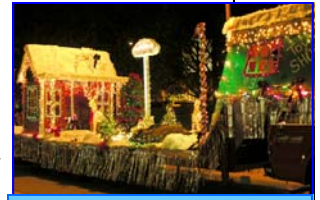
Downtown Christmas Parade

Saturday is just the beginning of it all. There will be several other chances to ice skate for free if you can’t go on Saturday (or if you want to go more than once!) Dates and times vary, so check www.itsalldowntown.com for a list of times. You can also get more information about all festival events there.