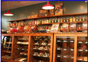
The Candy House--Sunshine

Creamy milk chocolate. Dark chocolate. Mint chocolate. Chocolate mousse. Chocolate cake. Hot chocolate. Chocolate-dipped strawberries. Is your mouth watering yet? If you love chocolate, and are tired of having to settle for whatever is available in the vending machine, have no fear—there are plenty of places in Springfield to get high quality chocolate!