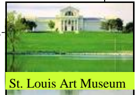
St. Louis Art Museum