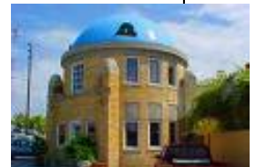
The Blue Dome District

If you want to shop—have no fear, Tulsa has plenty of opportunities for you! Utica Square is a charming and beautiful plaza you cannot miss. There are quality retail shops and restaurants galore. Another popular shopping district is Brookside, which in addition to shops offers restaurants and nightlife. Another spot for nightlife is the Blue Dome District. Whatever your interests, Tulsa has something for everyone. For more information and some great coupons, go to: www.visittulsa.com