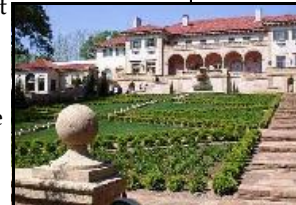
The Philbrook Museum

If you like art, you will want to go to the Gilcrease Museum. This is one of the best museums in the country to see American art and history. It has the world's largest collections of artifacts from the American west, including Native American art, in addition to historical manuscripts, documents, and maps. Another museum you might want to visit is the Philbrook Museum of Art. This museum is housed in a beautiful Italian-style villa built in 1927. Not only can you see beautiful art there (which includes works from America, Japan, Italy, Europe, Africa, etc.) you can also see the gorgeous architecture of the villa. In addition to the house, there are lush gardens on the property that you can tour.