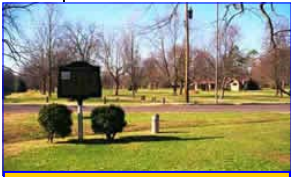
Phelps Grove Park

Since Halloween is on Wednesday, it is the perfect time to meet some of the ghosts that haunt Springfield. You have already heard that the Pythian Castle is haunted, but there are quite a few stories saying that we have some other spirits too— here are a few of them.